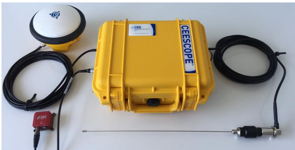
CEESCOPE-R™ system with internal Trimble RTK GNSS, SBG Systems Ellipse2-E

In addition to its simple physical connectivity, the data handling approach of the CEESCOPE-R further advances the usefulness of the system for challenging and space-constrained applications such as a PWC. Just like the standard CEESCOPE, the CEESCOPE-R applies a precise millisecond time tag to all data messages, keeping timing exceptionally consistent. HYPACK and Hydromagic software can use this time tag in data acquisition for bathymetry (position and depth) data but currently only HYPACK is able to also acquire motion data using the time-tagged format. The benefit for these types of applications is that WiFi may be used to acquire the data with no concerns about latency or lag errors. The use of the CEE format time tag means there is never a concern about any timing problems when telemetering all bathymetry, position, and attitude data to the acquisition device.