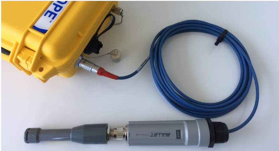
Bullet WiFi Radio Installed with Omnidirectional antenna suitable for PWC