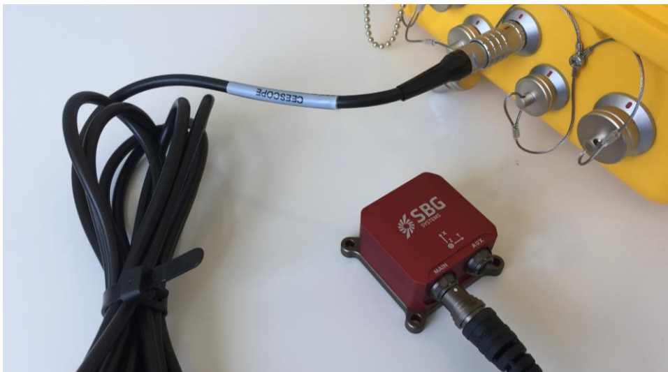
SBG Systems Ellipse2-E connected to heave / tide port

The HYPACK drivers for use with the CEESCOPE-R™ over WiFi are the following: